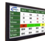
Large Screen Displays